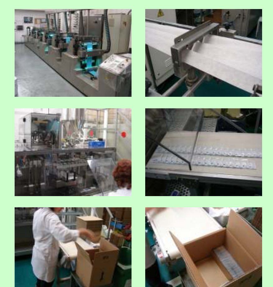
Refreshing towels Erfrischungstücher Verfrissingdoekjes Serviettes rafraîchissantes Toallitas refrescantes

The production of our sachets takes place under the most hygienical circumstances with modern printing and filling machines. The printing as well as the filling process is done on the same location so we are in control of the complete production process. For this reason we can guarantee a top quality end product. Our factory is fully ISO 9001: 2000 and ISO 14001 certified.